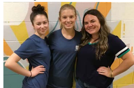
Epic Knows Nothing