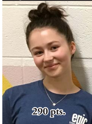
Vera Hile Epic Knows Nothing