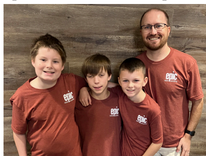
Epic Sauce the Knees

Epic God the Builder—0, Epic Sauce the Knees—80, NR Fellowship of the Ring—70