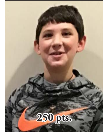
Little League Quizzer of the Month