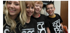
SCC Not Ashamed in 2021-2022

Uniforms. Teams are to wear matching shirts at all quizzes. “Matching” does not mean identical—it is sufficient if shirts match based on color or theme, although most teams get identical shirts. The idea is that they identify the quizzers as a team.