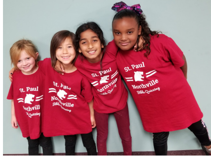
SPN Cool Cheetahs