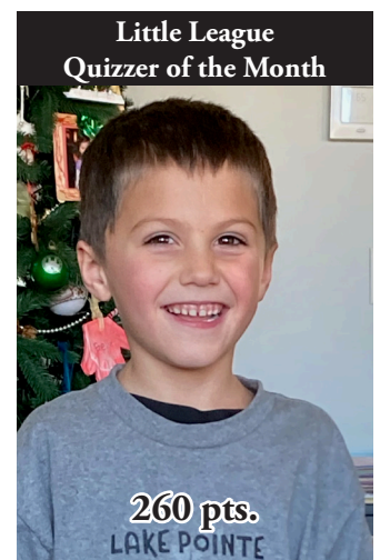
James Fales LP Cute Penguins