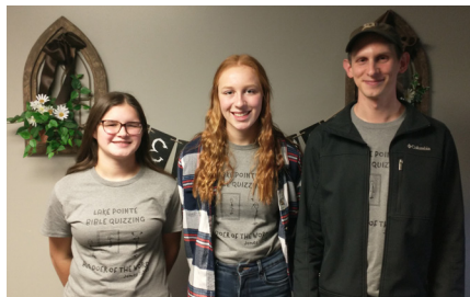
LP We are Lawbreakers