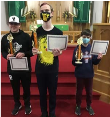
Champions The Little Children