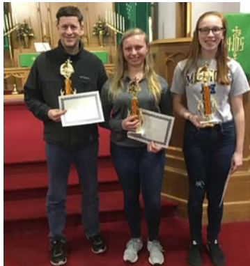
2nd Place One Point in History