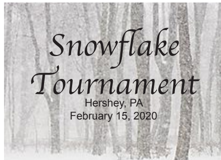
stay tuned for DBQ results from Snowflake