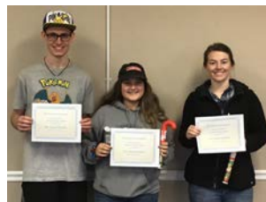
2nd Place The Imperishables

Eleven teams from Indiana, Michigan and Pennsylvania braved Winter Storm Jacob and attended the 12th Annual All Timers Tournament on January 18 at CrossPointe Community Church in Wayne.