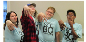
SCC Drunk on New Wine in 2022-2023

Uniforms. Teams are to wear matching shirts at all quizzes. "Matching" does not mean identical—it is sufficient if shirts match based on color or theme, although most teams get identical shirts. The idea is that they identify the quizzers as a team.